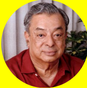
Dr Verghese Kurien

A quarterly magazine of Anandalaya Dec 2017 – Mar, 2018 : Issue - 3